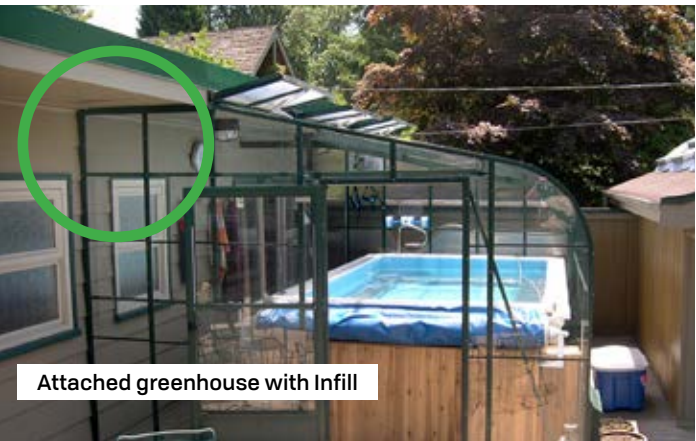
Attached greenhouse with Infill

If the area you are hoping to install the greenhouse has an overhang, such as roofing or second floor overhang, and you wish to connect your greenhouse to be flush with all siding, we can extend the glazing wall to attach to both the side of your house/building and the overhang. This referred to as an infill. Please let your greenhouse expert know if you will require an infill. This may require additional time for our team to get design line drawings to you.